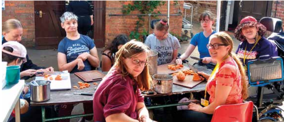
Pathfinders' cook team prepare the vegetables

Pathfinders is my favourite place, where I've made some of my happiest memories and closest friends. There is nothing like it. Come prepared to have fun, get stuck in, think creative, try something new, be a friend, and laugh until everything hurts. You'll go home tired, mucky, happy, with a bag of memories and new friends and with no regrets.