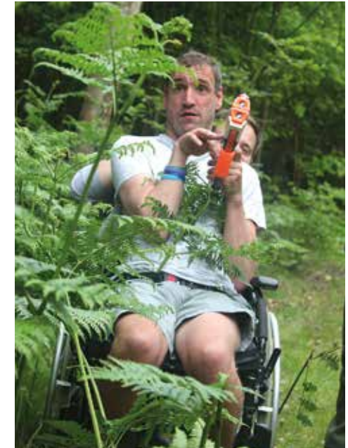
A camper enjoying photography