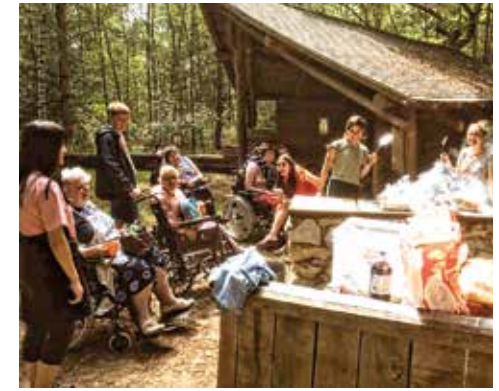
Evening supper at Alamo