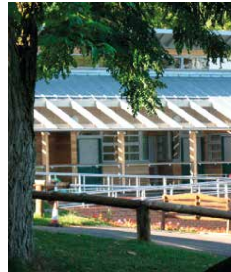
Bradbury Croft Opened in 2009