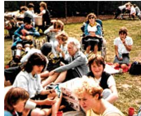
1986 Explorers' picnic at Bird World