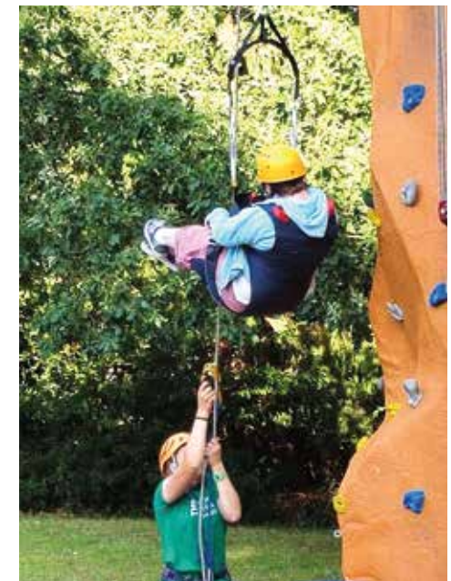
Pathfinders' climbing tower